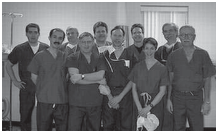
Attendees of March 2003 Advance Cornea Course

March 25-26, 2003 the Cornea Research Foundation sponsored the second Advanced Cornea Course for ophthalmologists wanting to enhance their surgical skills. The two-day advanced training course including live surgery and practiced in the lab, is designed to teach surgeons from across the nation a new method of cornea transplantation. This program features sutureless(no stitch) corneal transplants, posterior lamellar grafts and anterior lameller grafts. To ensure that all attendees can get hands on exprience, class size is limited. Next sessions will be held; July 29th-30th; September 30th-October 1st.