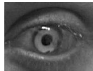
Fig. 2 After