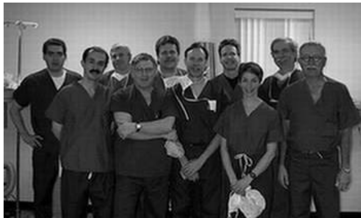
Attendees of March 2003 Advance Cornea Course

March 25-26, 2003 the Cornea Research Foundation sponsored the second Advanced Cornea Course for ophthalmologists wanting to enhance their surgical skills. The two-day advanced training course including live surgery and practiced in the lab, is designed to teach surgeons from across the nation a new method of cornea transplantation. This program features sutureless(no stitch) corneal transplants, posterior lamellar grafts and anterior lamellar grafts. To ensure that all attendees can get hands on experience, class size is limited. Next sessions will be held; July 29th-30th; September 30th-October 1st.