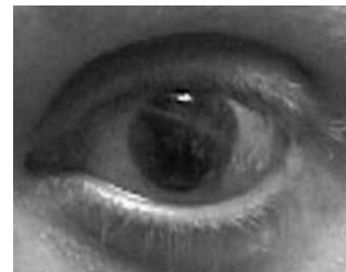
Fig 1. Before